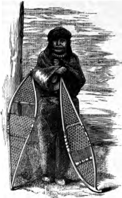
NORTH AMERICAN WITH HIS SNOW SHOES.

which ran through the length of them. We were informed they had been committing robbery and murder, for which they were being marched to New Westminster, for imprisonment.